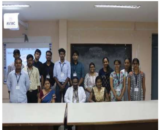
Panel discussion on Mentoring &Carrier Advancement