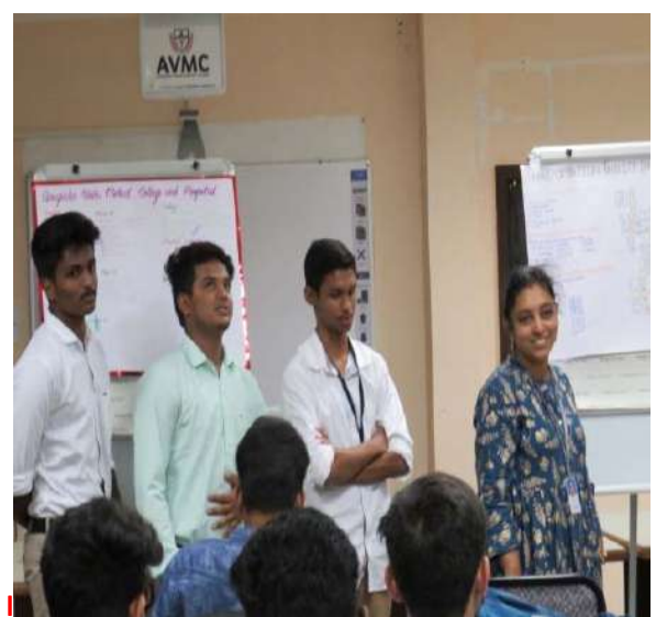
Transport facilities for AVMCians