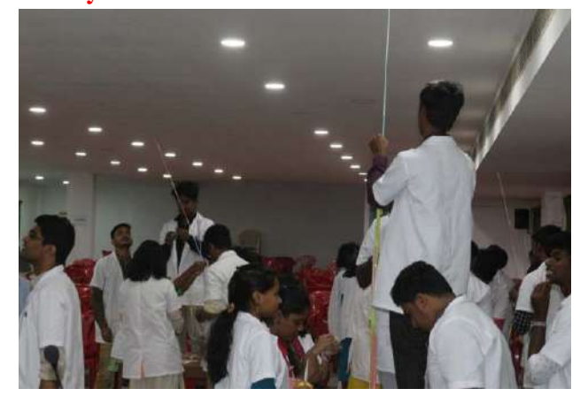
White coat ceremony